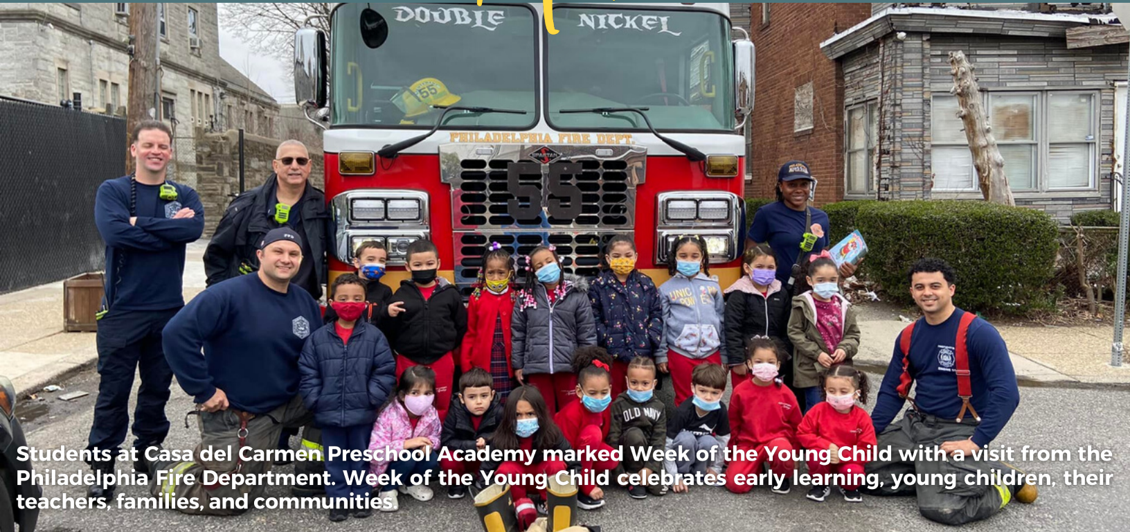
Students at Casa del Carmen Preschool Academy marked Week of the Young Child with a visit from the Philadelphia Fire Department. Week of the Young Child celebrates early learning, young children, their teachers, families, and communities.