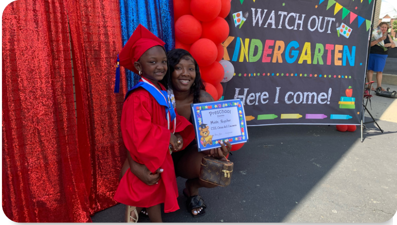
▲ A graduate of Casa del Carmen Preschool Academy takes a picture with her mom after receiving her diploma at a June 24 drive-through graduation ceremony.

Casa del Carmen Preschool Academy marked the end of the 2021-2022 academic year by honoring 56 preschool graduates and their families with a special drive-through graduation celebration! Casa del Carmen Preschool Academy is a ministry of Catholic Social Services located in North Philadelphia.