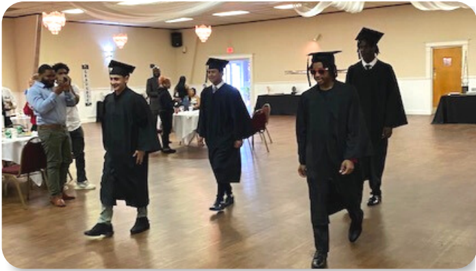
▲Young men from St. Francis & St. Vincent Homes mark the end of the 2021-2022 academic year with a graduation ceremony on campus.