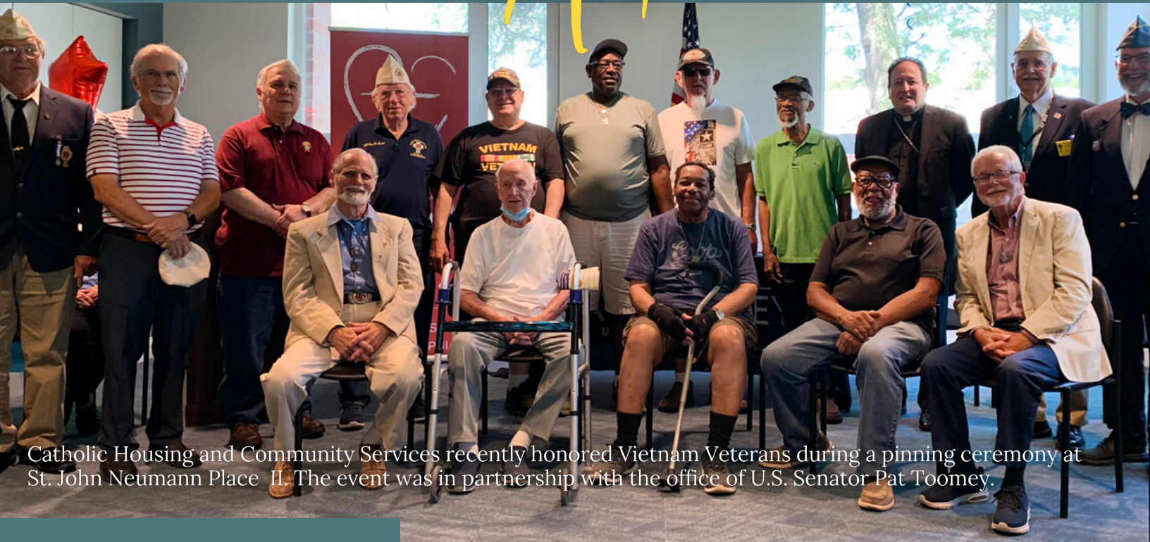
Catholic Housing and Community Services recently honored Vietnam Veterans during a pinning ceremony at St. John Neumann Place II. The event was in partnership with the office of U.S. Senator Pat Toomey.