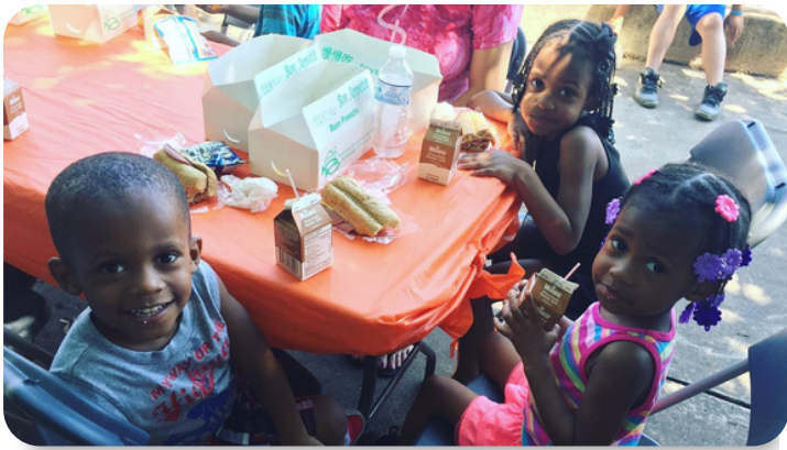
▲ Children enjoy a healthy and wholesome lunch during the summer thanks to Nutritional Development Services.

This summer, NDS is partnering with approximately 300 sites serving children and youth to put this critically important initiative into motion. It fills the meal gap for many low-income students and families who would otherwise struggle to obtain balanced nutrition following the conclusion of the academic year.